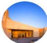
St. Philomena Parish