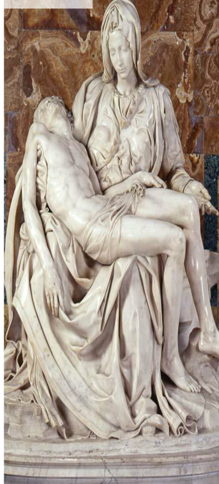
Piece: The Pietà , 1499 Artist: Michelangelo Location: St. Peter's Basilica